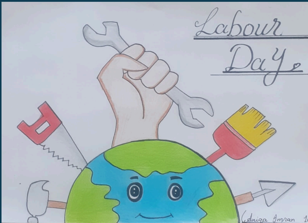
By Aniqa Imran